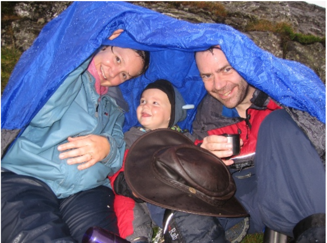
Luncheon on Robinson

Diverse members of the expedition then returned to Seatoller via the omnibus, or tried the Lakeland ales of the Bridge Hotel as was their wont.