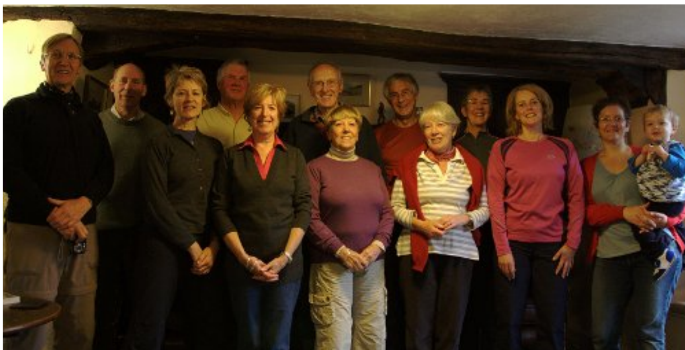
Tricouni Club Autumn Meet 2009